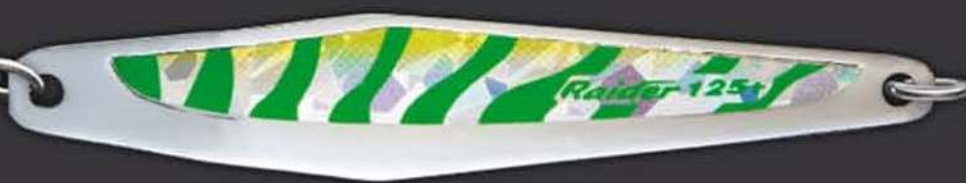
Size 125 Approx 4 3/8oz