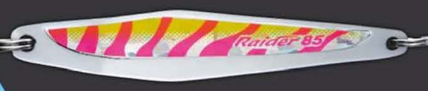
Size 85 Approx 3oz