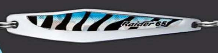
Size 65 Approx 2 1/4oz