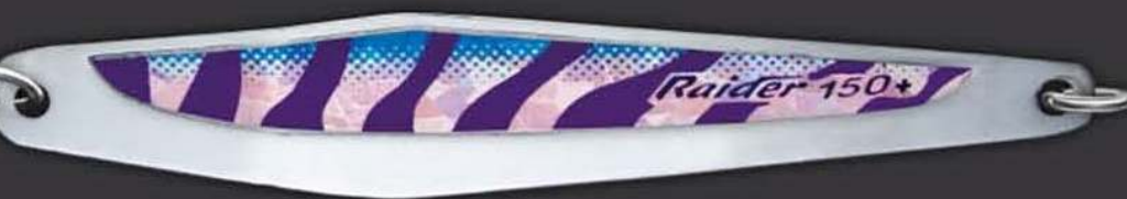
Size 150 Approx 5 1/3oz