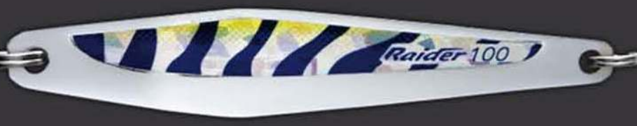
Size 100 Approx 3 1/2oz