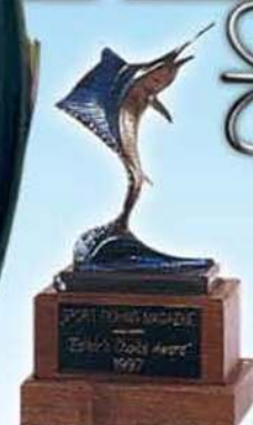
Sport Fishing Magazine ICAST "Editor's choice Award" 1997