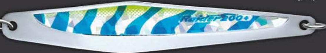
Size 200 Approx 7oz